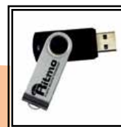
Software Ritmo Transfer