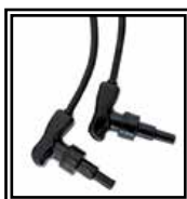
90° Universal connectors 4.0-4.7mm